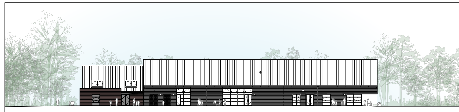
Proposed South East Elevation