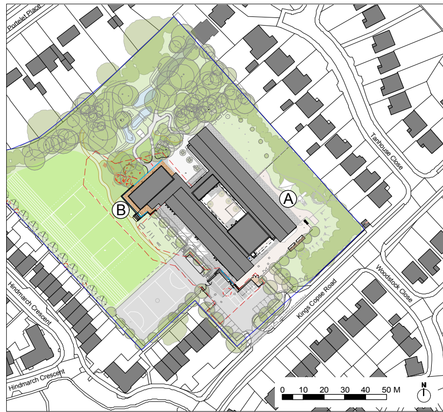
Existing Site Location Plan (A) - Existing School (B) - Proposed Extension