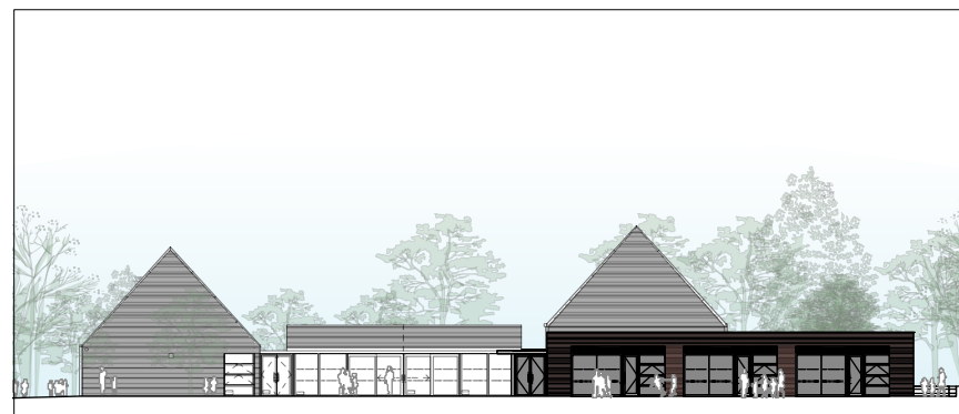
Proposed South East Elevation